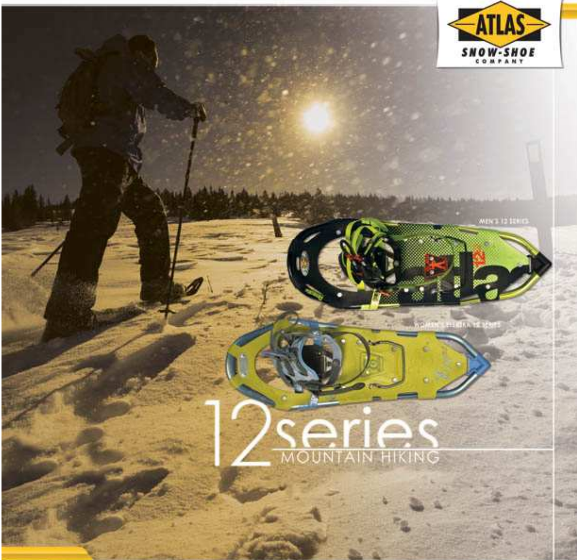
MEN'S 12 SERIES